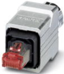
RJ45 connector, IP67, with push/pull interlocking (version 14), metal housing, for 1 Gbps, for 24 ... 25 AWG stranded conductors

Please be informed that the data shown in this PDF Document is generated from our Online Catalog. Please find the complete data in the user's documentation. Our General Terms of Use for Downloads are valid ( http://download.phoenixcontact.com )