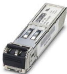
Gigabit SFP module for transmission up to 2 km with a wavelength of 1310 nm.

Please be informed that the data shown in this PDF Document is generated from our Online Catalog. Please find the complete data in the user's documentation. Our General Terms of Use for Downloads are valid ( http://phoenixcontact.com/download )