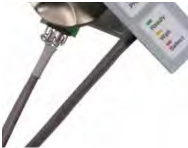
Protect component wiring leads from heat and abrasion with Insultherm Tru-Fit for an attractive and permanent finish.

Insultherm Tru-Fit provides a sturdy, long lasting, and inexpensive insulation solution. It is flexible and expandable, and can easily be installed over applications with irregular shapes and tight turns. Standard colors are Black and Natural, but other colors are available by special order. Contact your account representative for details.